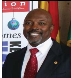
Tennell Atkins City of Dallas Councilman