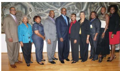
Picture of Past TABCCM President’s with City of Houston Councilmembers