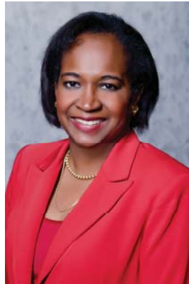
Sheryl Cole City of Austin Mayor Pro Tem