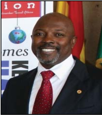
Tennell Atkins City of Dallas Deputy Mayor Pro Tem