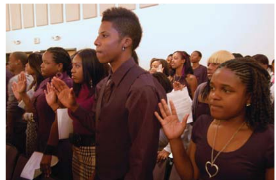
* Article and pictures provided by Wiley College