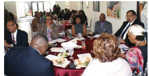
Picture of audience from luncheon